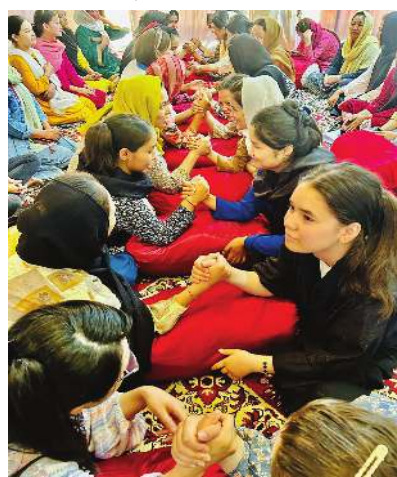
A view of training at Rawalpindi