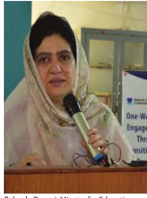
Raheela Durani, Minister for Education, Balochistan speaking at a sport festival in Quetta.