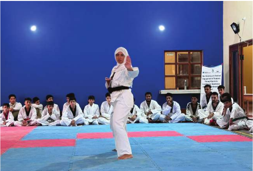
Building tolerance against stress and anger through sports in Quetta. A girl in Taekwondo action