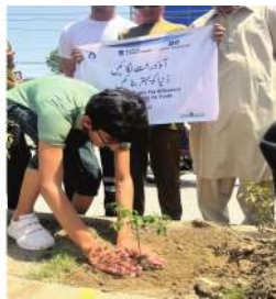
Celebration of World Environment Day at D.I. Khan