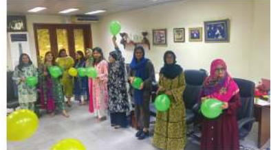
A training session of apparel women workers at Rawalpindi