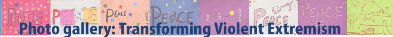
Photo gallery: Transforming Violent Extremism through advocacy, lobbying, sports and culture