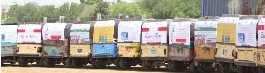
Peace Awareness Rickshaw Campaign at opposite Mazar-e-Quaid Ground, Karachi