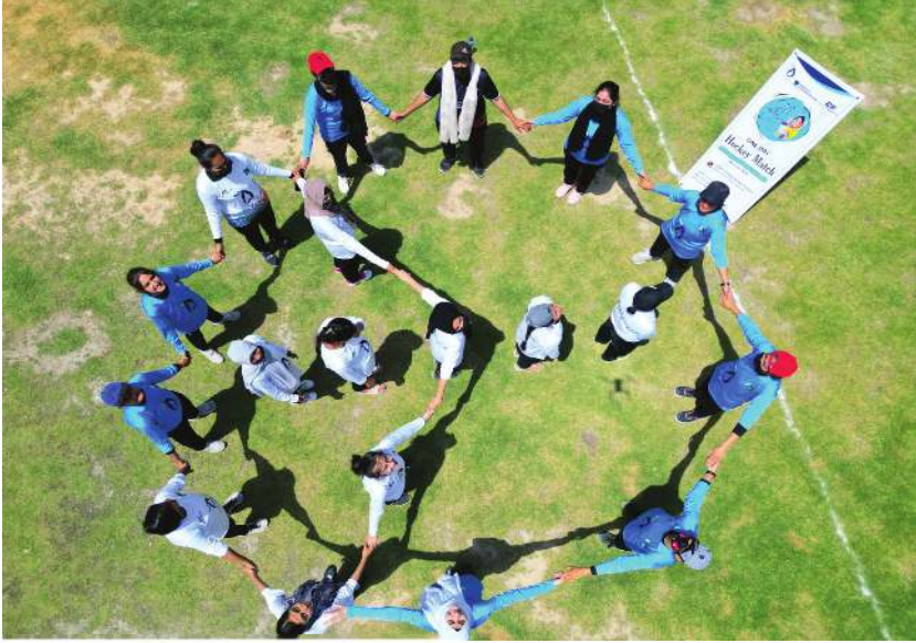
Women hockey player depicting Khawateen Maimar-e-Aman logo in Haripur