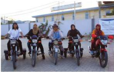
Persons with Disability on special bikes at Sports Complex Karachi