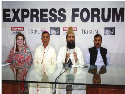
Panel discussion at Express Forum event