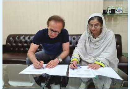
AF signed MoU with Department of Journalism and Mass Communication of KP University on 14th Sept. 22.