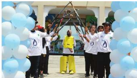
Women hockey players in a promotion of peace pose, Haripur