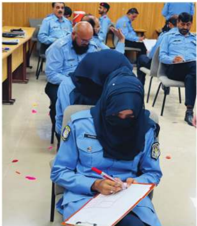
An exercise during training session at Capital Police collage, Islamabad